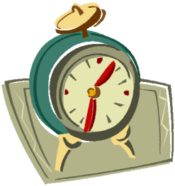
Effective committees equal efficient business meetings where “minutes” are kept and not lost.

The committee will choose the best possible choice(s) to present to the club. Each choice will have an explanation/present the facts. The report will be in writing and presented to the secretary for the minutes. The committee may even choose to have a motion prepared to begin discussion by the club.