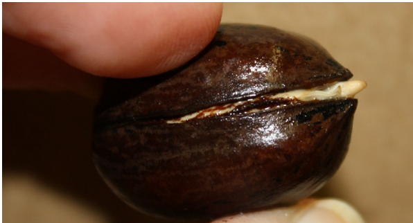
Radicle above is at the correct stage for planting.

After about 4-5 days, you should see a tiny root (radicle) starting to emerge from the pecan; that means it is time to plant! If the radicle is allowed to grow too long, it becomes very fragile and may break during planting, so don't wait too long to plant! Some nuts will germinate quicker, but most will within 1 week.