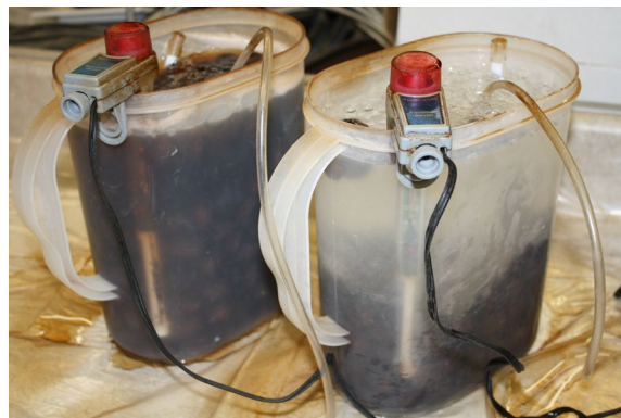
One pitcher with fresh water and a second pitcher shows water after one day. Water should be changed daily.