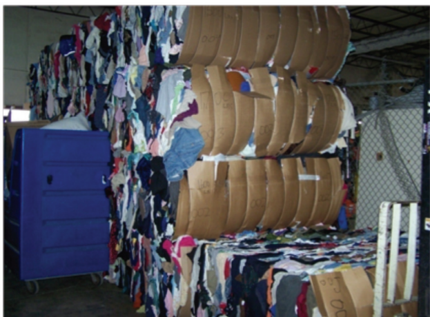
Figure 2. Baled textiles awaiting pickup by rag dealer.

According to the U.S. Environmental Protection Agency, each year more than 4 billion pounds of carpet go into the solid waste stream 4 . Recycling unwanted household textiles is one way to increase sustainability. Most carpets are not biodegradable, so discarded carpets remain in landfills. Fortunately, household carpets are made from durable and recyclable materials (nylon, polyester and olefin) that manufacturers can use to produce new products. Rugs made from natural fibers, such as wool, may be shredded and the fibers reused. Considering replacing your brown shag carpeting from the 70s? Try to recycle it!