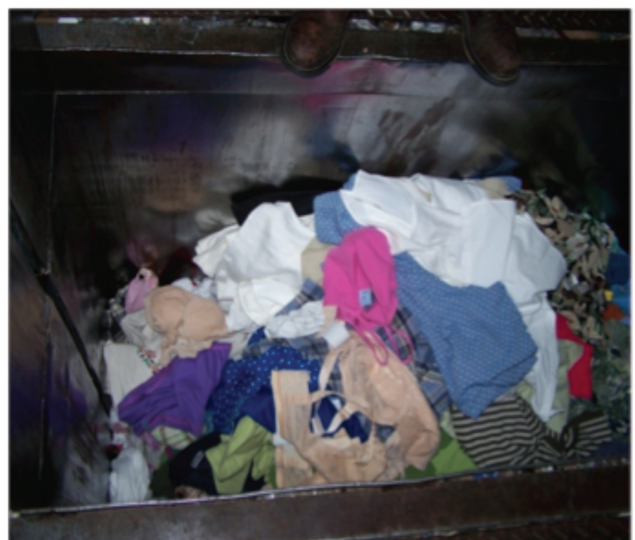
Figure 1. A steel baler with a deep pit compacts unwanted textiles into bales.