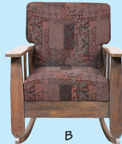
File: Youth and 4-H

... and justice for all The U.S. Department of Agriculture (USDA) prohibits discrimination in all its programs and activities on the basis of race, color, national origin, gender, religion, age, disability, political beliefs, sexual orientation, and marital or family status. (Not all prohibited bases apply to all programs.) Many materials can be made available in alternative formats for ADA clients. To file a complaint of discrimination, write USDA, Office of Civil Rights, Room 326-W, Whitten Building, 14th and Independence Avenue, SW, Washington, DC 20250-9410 or call 202-720-5964. Issued in furtherance of Cooperative Extension work, Acts of May 8 and June 30, 1914 in cooperation with the U.S. Department of Agriculture. Jack M Payne, director, Cooperative Extension Service, Iowa State University of Science and Technology, Ames, Iowa.