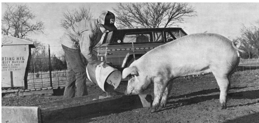
A 4-H member hand feeding his gilt a balanced ration.

breeding time (7 to 8 months of age) gilts should be limit fed so they will weigh 250 to 275 pounds at breeding time.