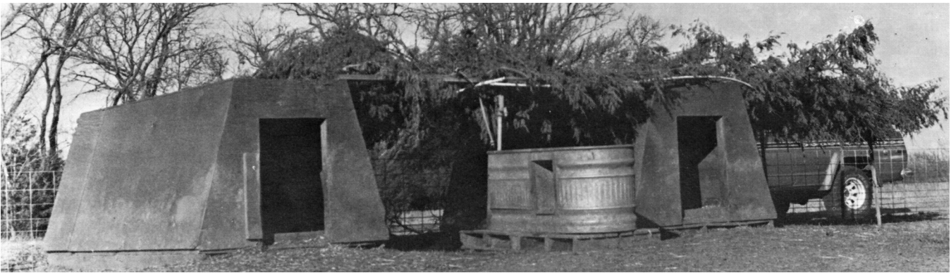
Plywood houses with a cedar shade break and an automatic watering system