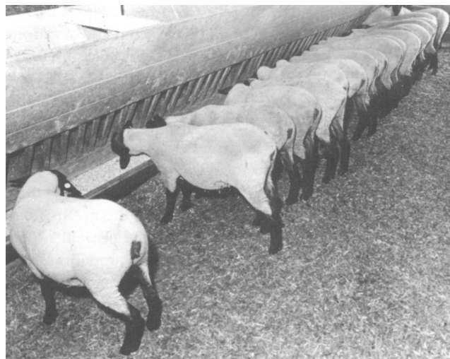
Figure 1. Good management, nutrition, and health programs are important in the production of market lambs and replacement ewe lambs.

Creep rations are not difficult to make. As long as the lambs are nursing the ewe, protein will be provided through the milk. Therefore, additional energy is the element provided in the creep ration. This can be obtained by feeding grains. Creep rations are often all grain rations. Corn, milo, oats, barley, and wheat are examples of grains that can be used. The ewe will train the lambs to eat. Therefore, it would be wise to put the same grain that is fed to the ewe into the lambs' creep. It should be noted that young lambs like the cracked or crimped grains, while older sheep like coarse or whole grains best. With this in mind, a creep ration will be more palatable to the lambs if the grain is cracked or crimped.