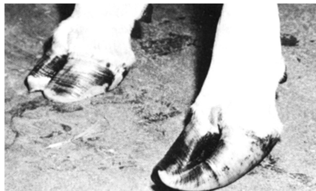
Figure 1. A trimmed and untrimmed hoof.

Next, allow the animal to stand on a hard, flat surface so that you can observe the job to be done. Are the toes too long? Does the animal stand flatly on her feet, or are the bottoms of the hooves rounded? Figure 1 show a foot that needing trimming and one that is properly trimmed. The foot on the right is too long and rounded on the bottom. When trimmed correctly, it should look like the one on the left.