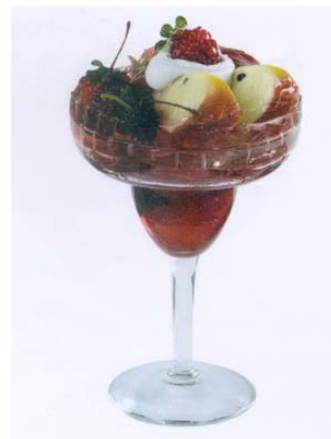
Parfait Cup — Fluted cup designed to serve sundaes and parfaits.