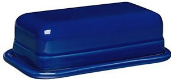
Butter Dish — A small dish with cover used to store and serve butter.