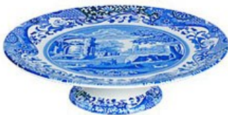
Cake Platter —A cake platter is a large serving plate for desserts. The shape is often round, but it may enough to hold virtually any shape and size of cake except maybe a bigger sheet cake. be square or rectangular. It's usually made large