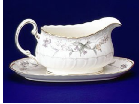
Gravy Boat — An elongated dish or pitcher for serving gravy