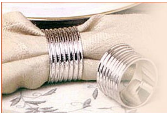
Napkin Ring — A circular band used to hold a particular person's napkin.