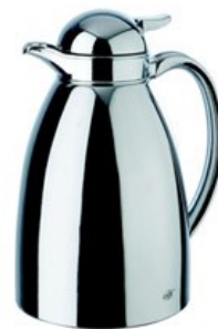
Carafe — A glass or metal bottle, often with a flared lip, used for serving water or wine. A glass pot with a pouring spout used in making coffee.