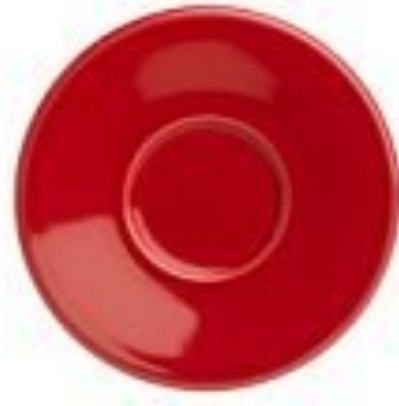
Saucer — A small shallow dish having a slight circular depression in the center for holding a cup