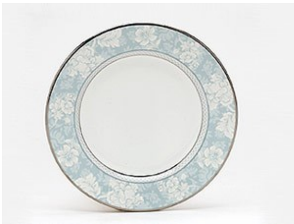
Bread Plate — A small plate used to hold bread while eating