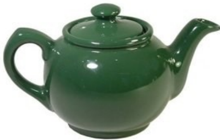
Tea Pot — A pot used for Tea.