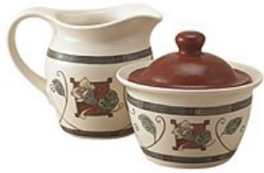
Creamer and Sugar Set — A set used to hold and serve creamer and sugar at the table