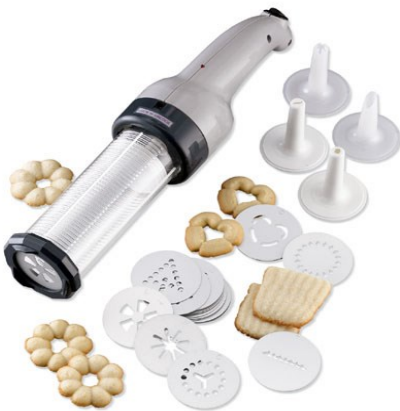
Pastry Press — Any type of press used to shape or mold cookies.