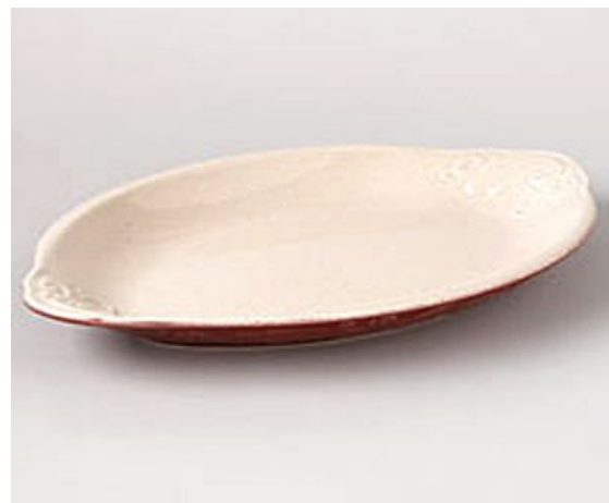
Meat Platter — A large serving plate